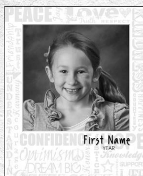
Word Art Print

Check out our SPECIAL OFFERS and ADDITIONAL PRODUCTS that are only available online!