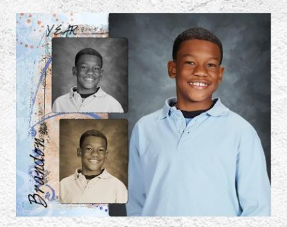
8x10 Custom Art print