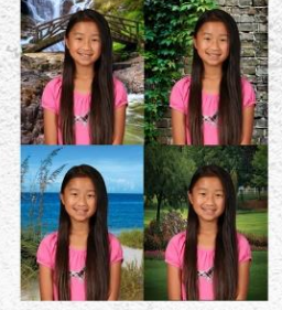
4 - 4x5 Magnet Sheet (w/outdoor backgrounds shown)